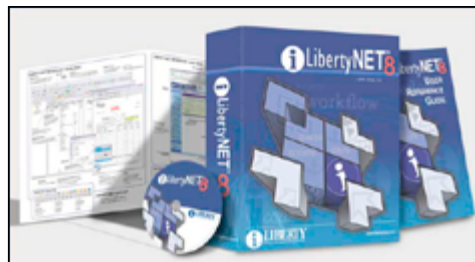
Packaging: Product logo design, box design, insert die design, user reference guide, quick reference sheet, illustrations, screen views, dvd/cover design.