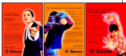
"Hero" Advertising Campaign: Ideation, copy, media buying, layout.