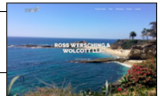
Responsive Websites: logo design, photography rossllp.com .